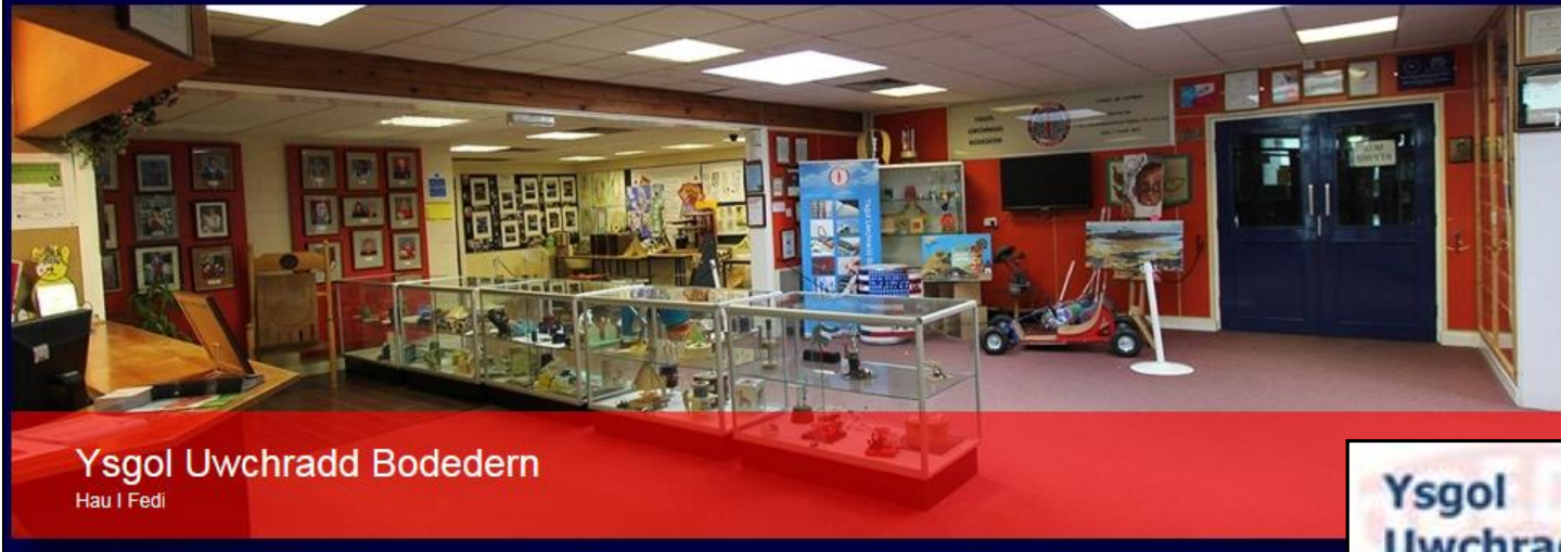
Ysgol Uwchradd Bodedern Hau I Fedi

Hafan Newyddion Ysgol ▼ Disgyblion ▼ Staff ▼ Rhieni a'r Gymuned ▼ Llywodraethwyr ▼